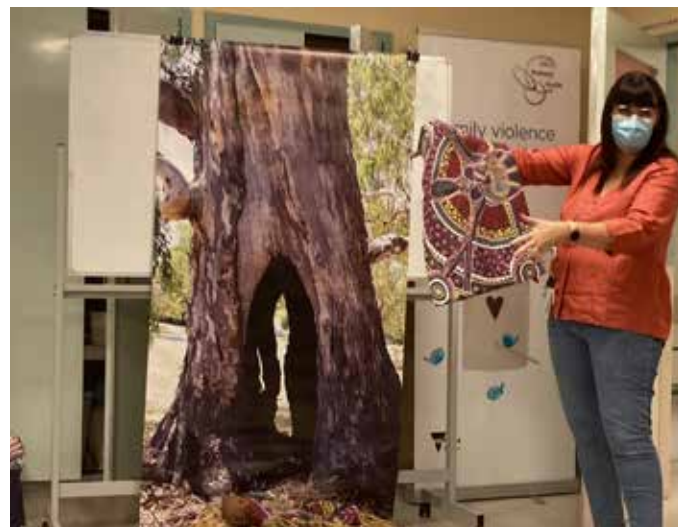
A drop-down wall covering of a birthing tree (printed from a blown up photo, taken by Shree on her mobile phone) and grass tiles