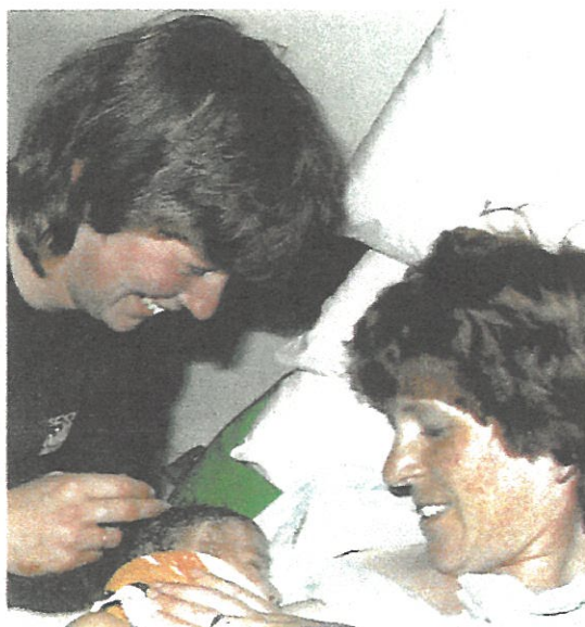
Midwife, baby 20 minutes old and mother in Launceston's Birth Centre.